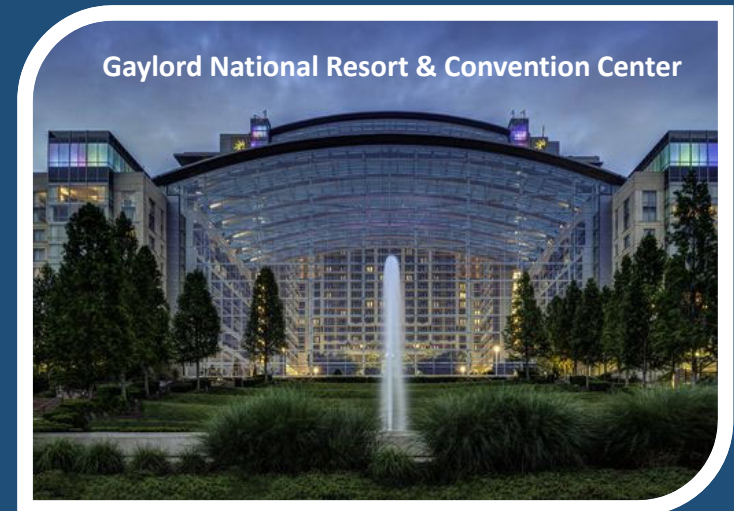
Gaylord National Resort & Convention Center